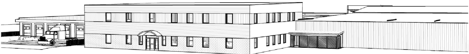
Artist rendering of the updated Tyoga facility